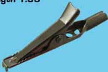
Alligator Clip, Steel, Fang Tooth with Barrel